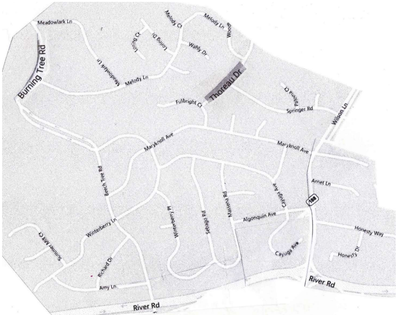
(names of Burning Tree Rd and Thoreau Dr added)

The streets included, in addition to the ones listed above, are Algonquin Avenue, Amy Lane, Arnet Lane, Cayuga Avenue, Deep Creek Court, Fulbright Court, Honesty Drive, Honesty Way, Kenfield Court, Loring Court, Loring Drive, Maryknoll Avenue, Massena Road, Meadowlark Lane, Melody Court, Paloma Court, Pawtucket Road, Richard Drive, Sebago Road, Summer Mill Court, Wahly Drive, and Winterberry Court, Lane and Place.